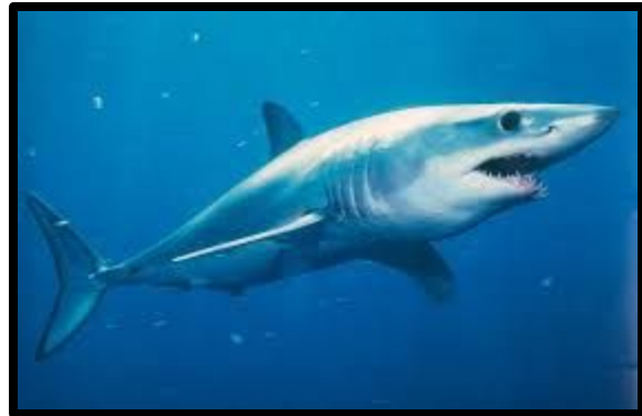
The shortfin mako shark is the fastest shark. It can swim up to 45 miles an hour!