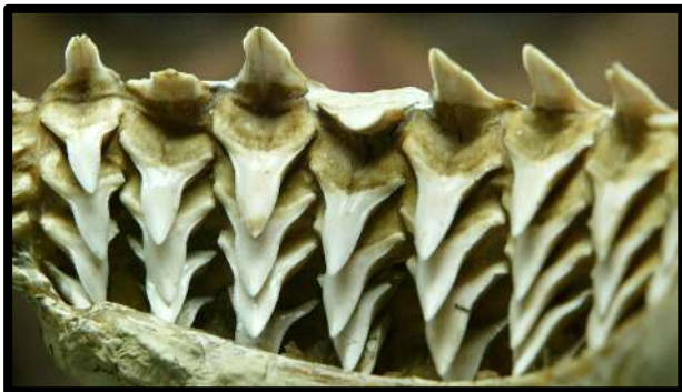
Many sharks have multiple rows of teeth in their mouths, with new teeth moving forward as teeth are lost.