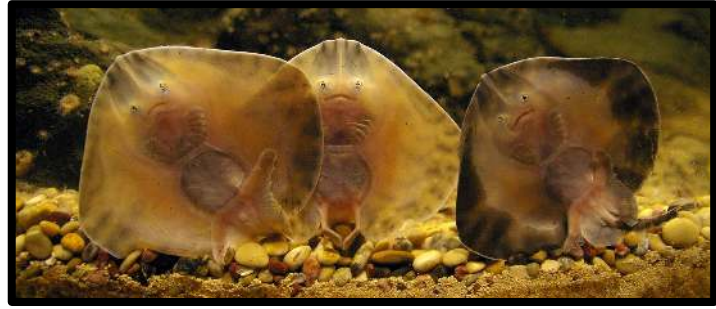
Sharks are elasmobranchs, which makes them closely related to rays and skates, such as these little skates.