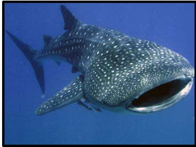
The whale shark is the biggest shark, up to 60 feet long! They are filter feeders, with a diet of mostly plankton.