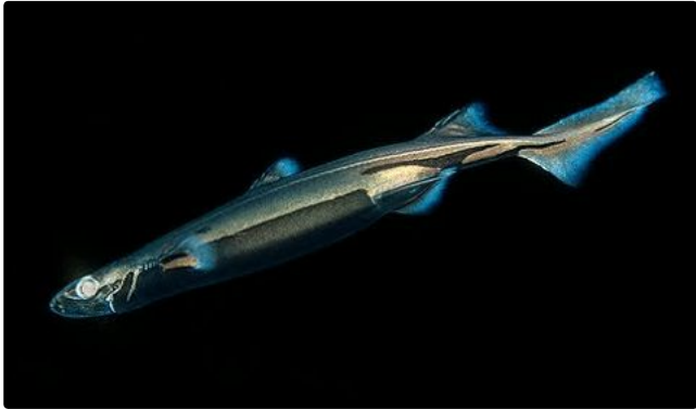
The dwarf lanternshark is the smallest shark, growing only 6-8 inches long. They are also bioluminescent!