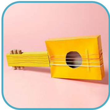
Cardboard Box Guitar

Below are a few examples of our favorite instruments to inspire your creativity!