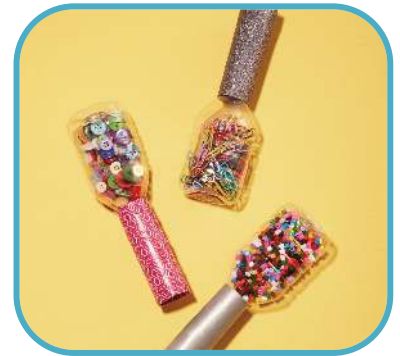
Water Bottle Maracas