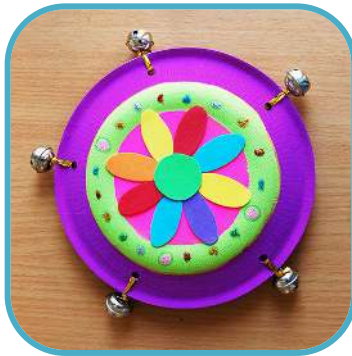
Paper Plate Tambourine