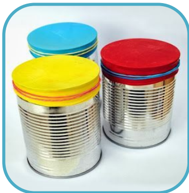
Tin Can Drum