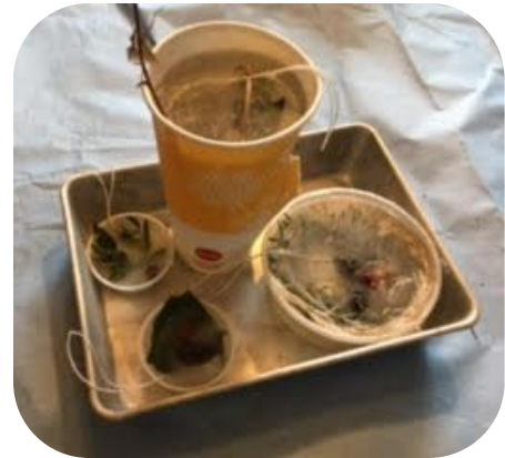
Check the next day