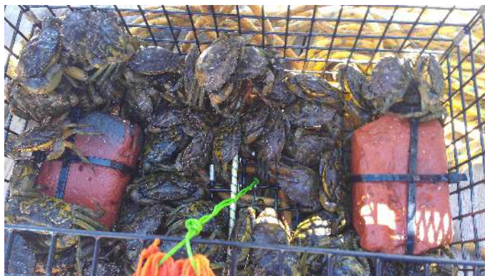
Green Crabs collected and measured at SSC for research